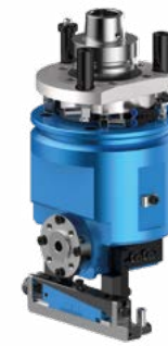
FLOATING H S Horizontal floating trimming unit