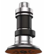
SIMOLO Orbital sanding unit for flat surfaces, convex and concave surfaces