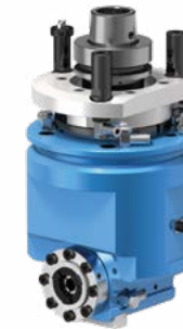
1 FLOATING H Tenso Horizontal floating trimming unit for vertical grooves for Tenso P-14 connecting fitting