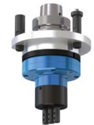
2 MULTI V3 Cabineo Vertical multi-spindle head for machining pockets for Cabineo connecting fitting