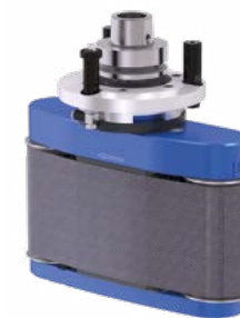
COLLEVO + Belt sanding unit for flat surfaces, exterior and inside roundings