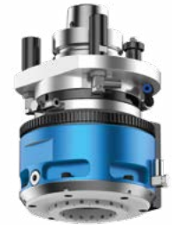
FLOATING V C Vertical floating trimming unit